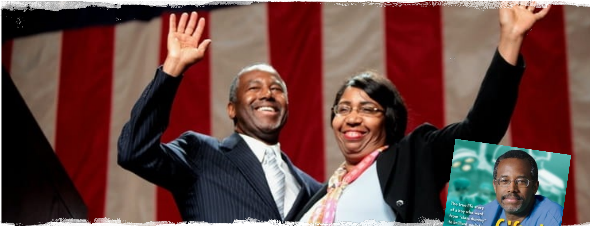
Dr. Ben Carson